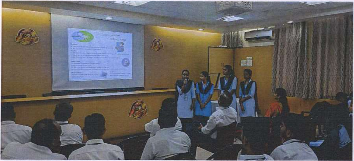
Project presentation by students.